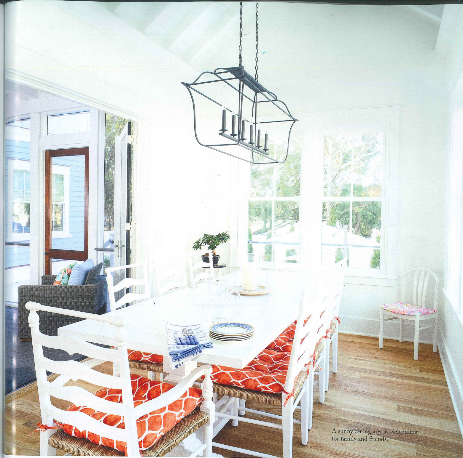
A sunny dining area is welcoming for family and friends.

"We rented in Isle of Palms several times and it meets our daily