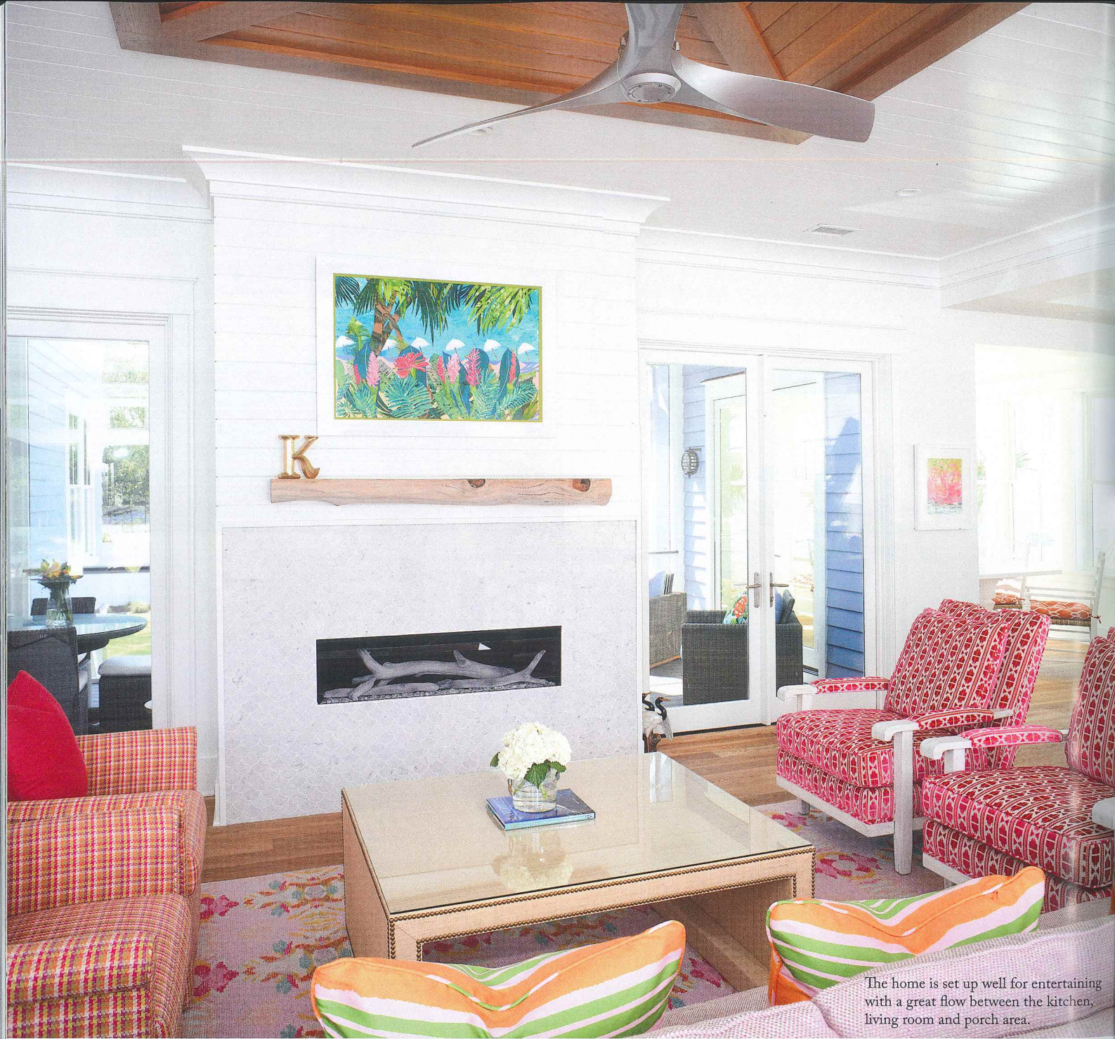
The home is set up well for entertaining with a great flow between the kitchen, living room and porch area.