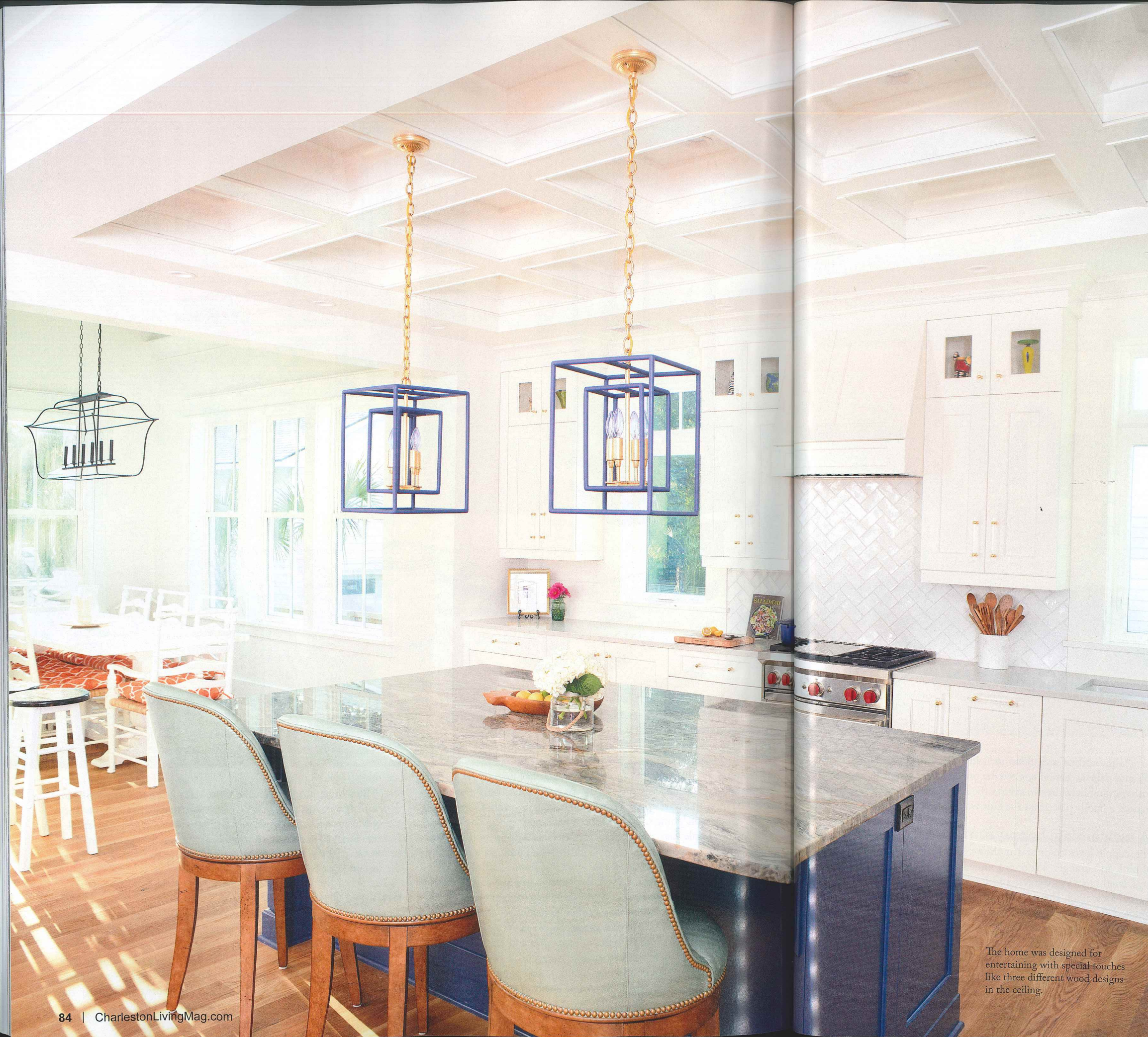
The home was designed for entertaining with special touches like three different wood designs in the ceiling.